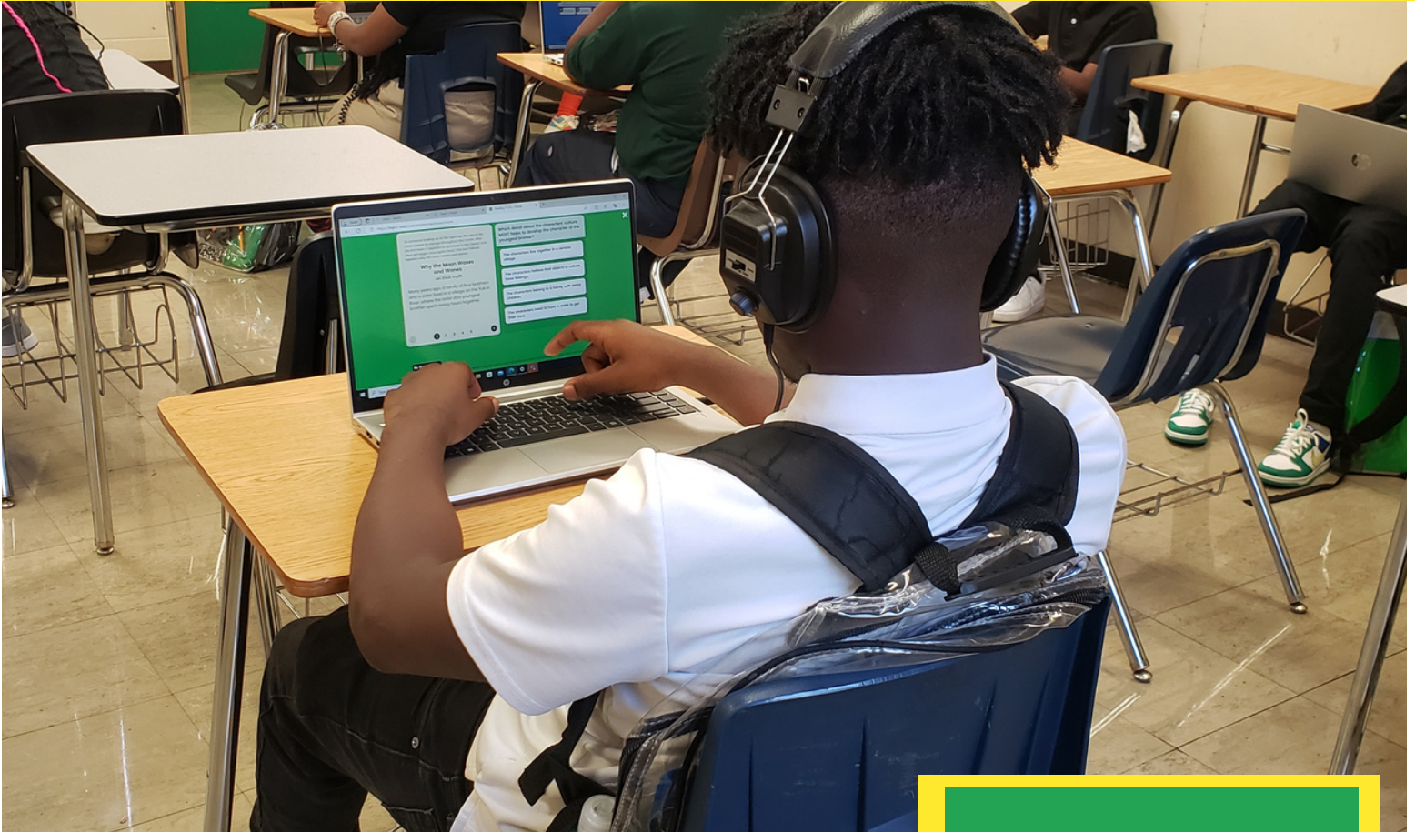
A Chickasaw MS 8th Grade Scholar diligently engages in an iReady lesson.